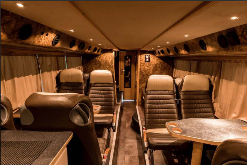
Lounge lower deck, driving direction