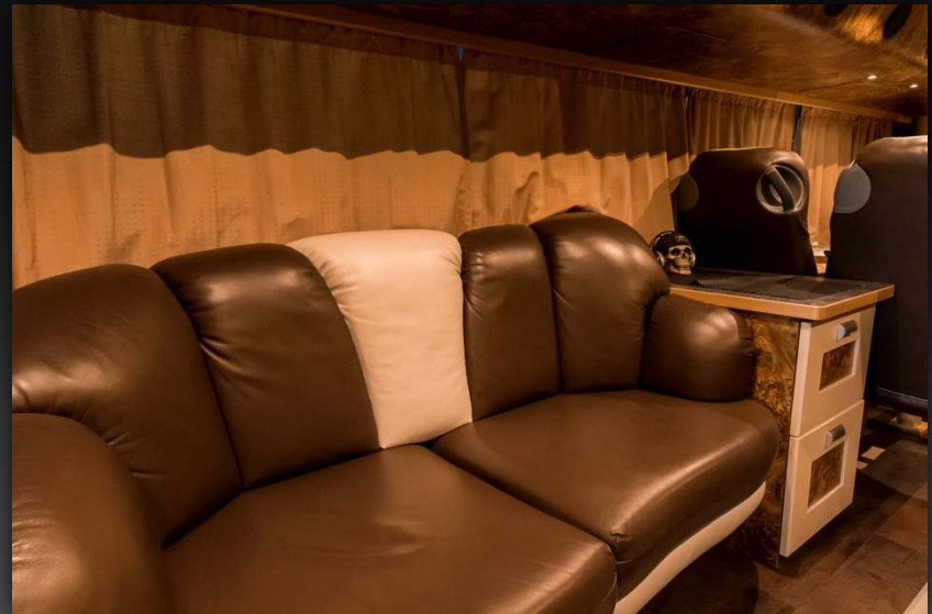
Sofa lounge lower deck