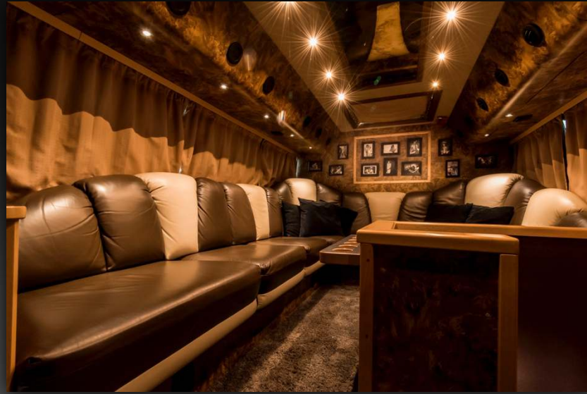
Front lounge upper deck