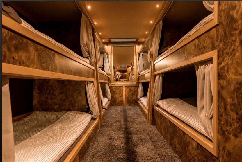
Sleeping area, driving direction