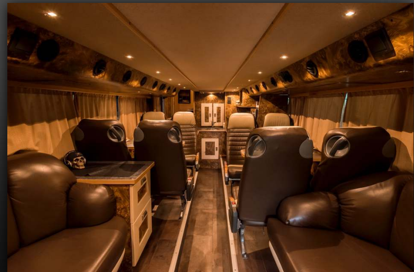
Lounge lower deck