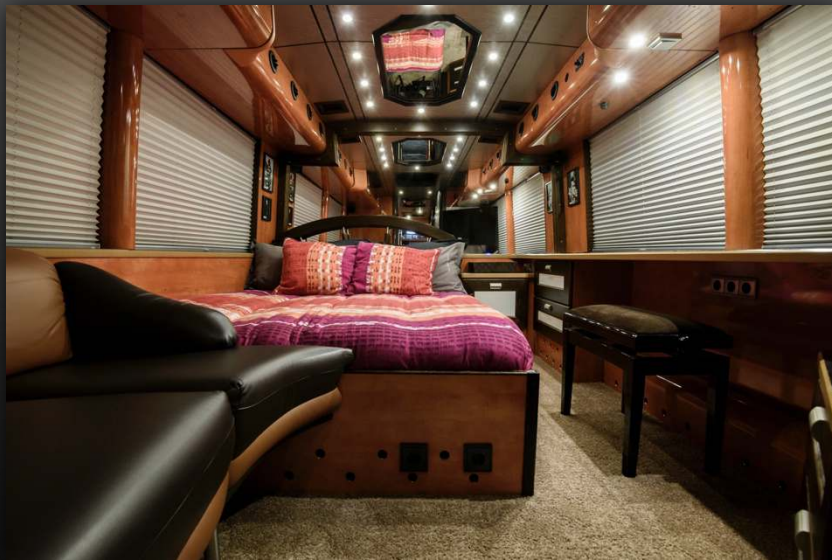
Executive suite with double bed