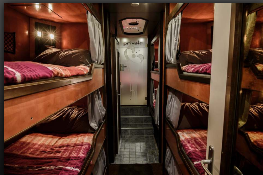
8 berths in passage