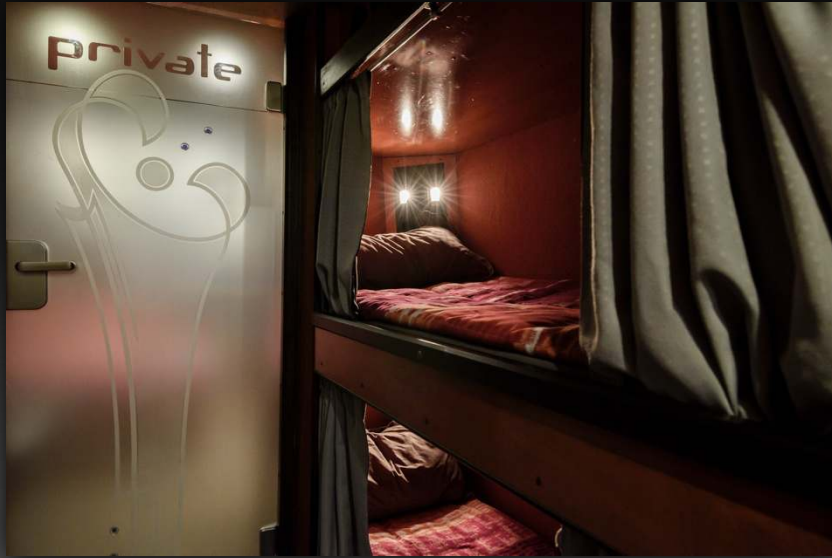
Two bunks x-large bunks