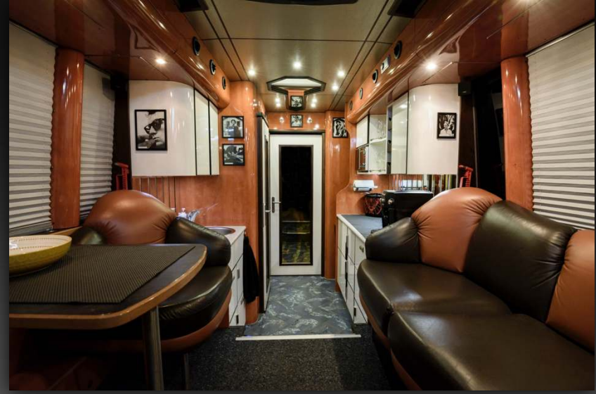
Lounge towards kitchen area