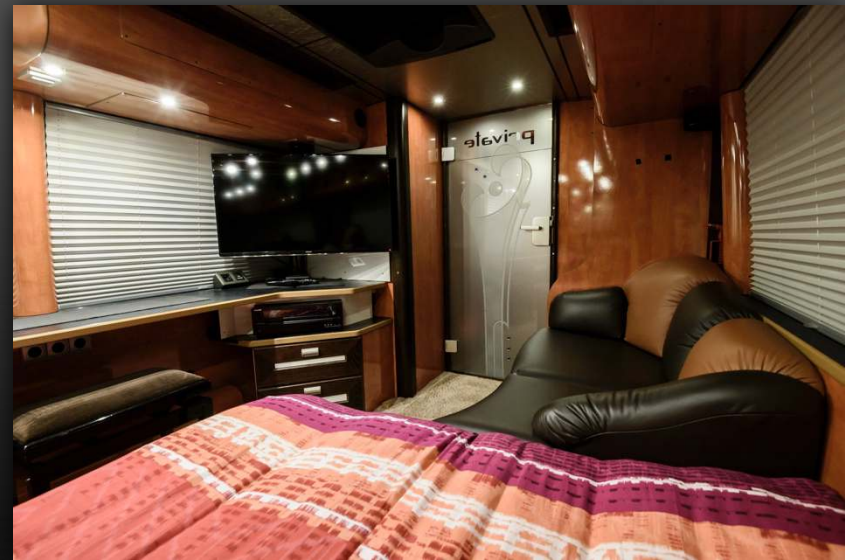
Executive suite driving direction