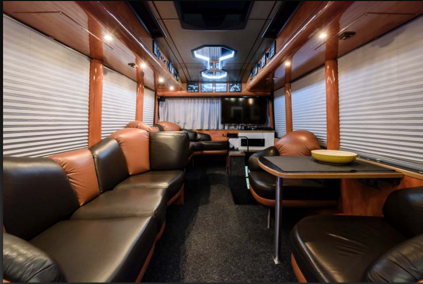
Lounge driving direction