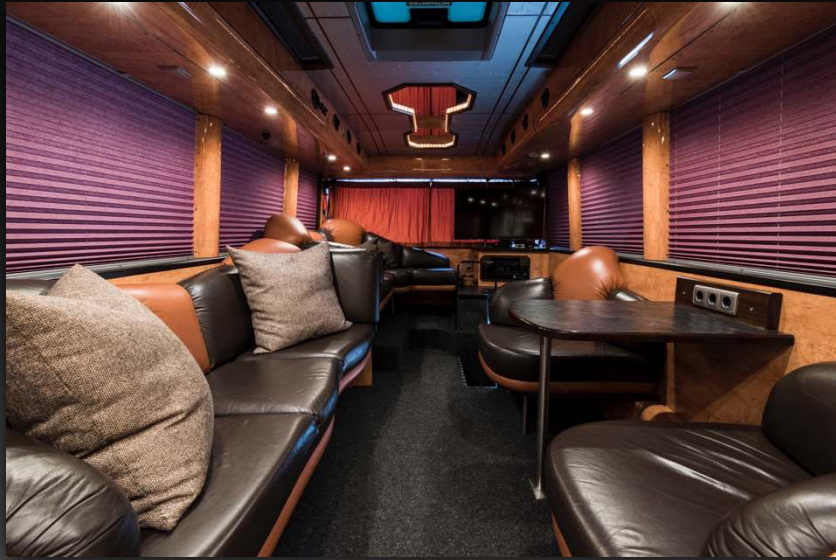
Lounge driving direction