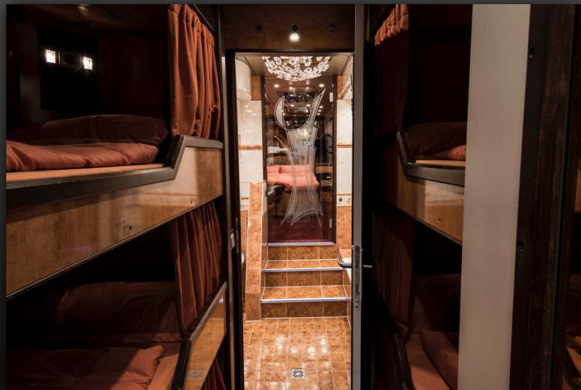
6 berths in passage