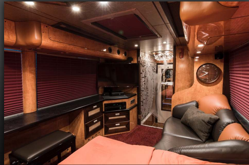
Star room driving direction