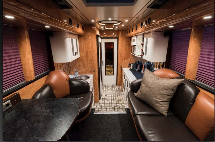
Lounge towards kitchen area