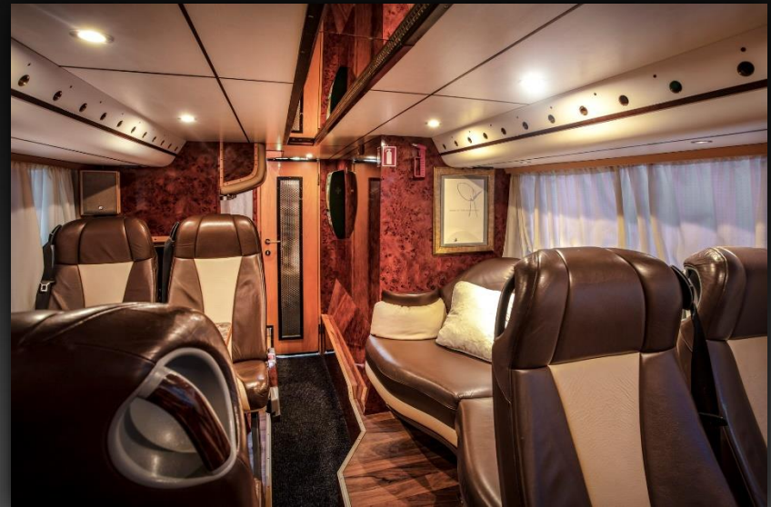
Lounge downstairs (driving direction)