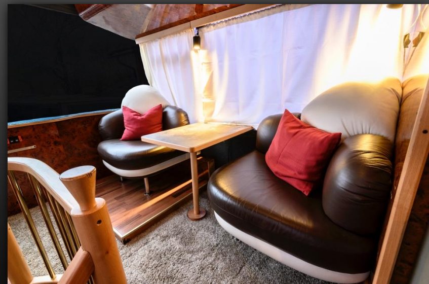
Upper front lounge