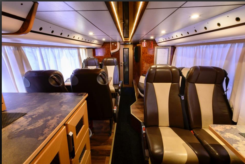
Lounge downstairs (driving direction)