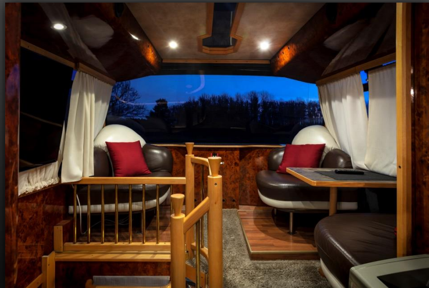
Upper front lounge