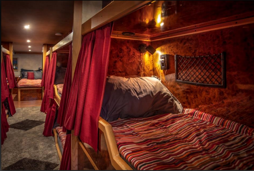
Open doors towards star room