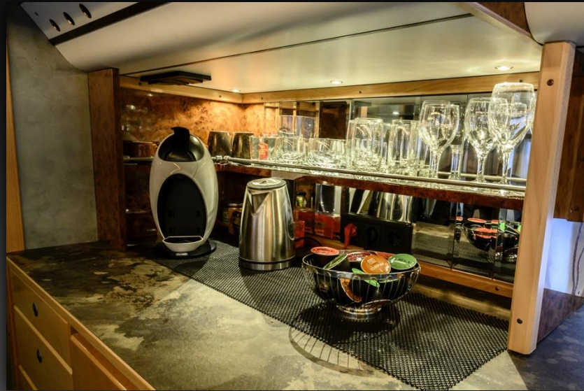
Coffe maker etc. of your choice