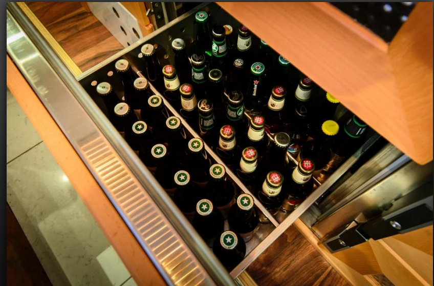
Large 5-drawer style fridge