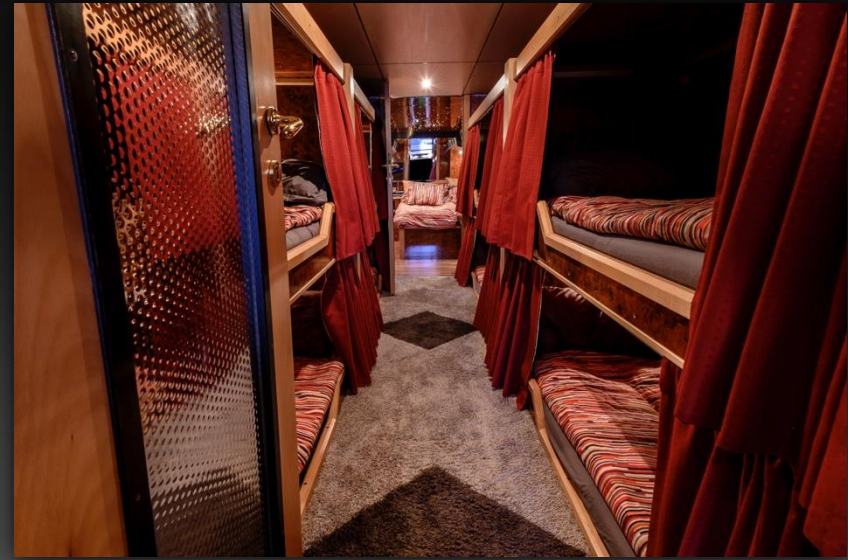
Second section of eight bunks