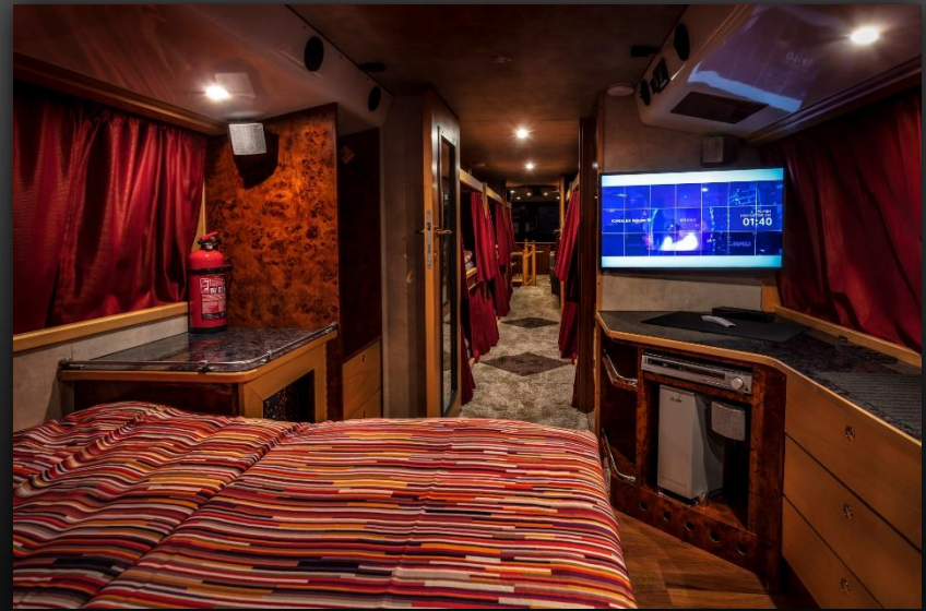
Star room (driving direction)