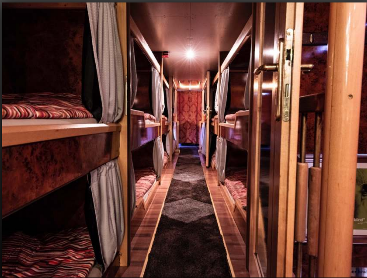
14 bunks (driving direction)