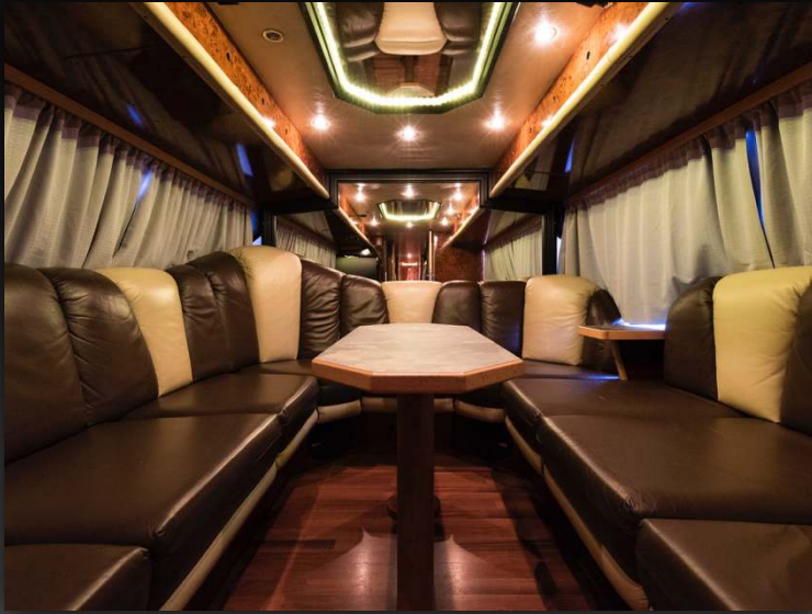
Lounge upper deck