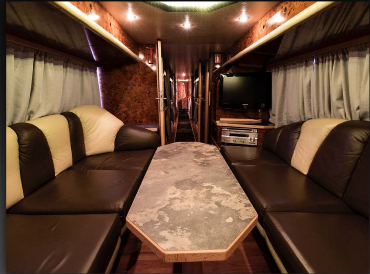
Lounge upper deck (driving direction)