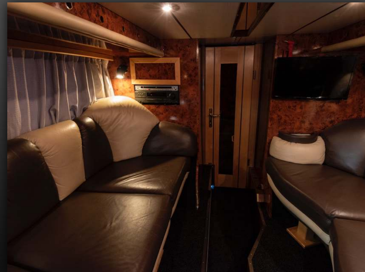
Lounge (driving direction)