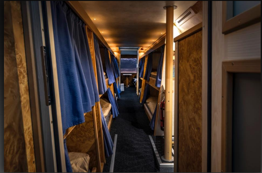
Sleeping area, driving direction