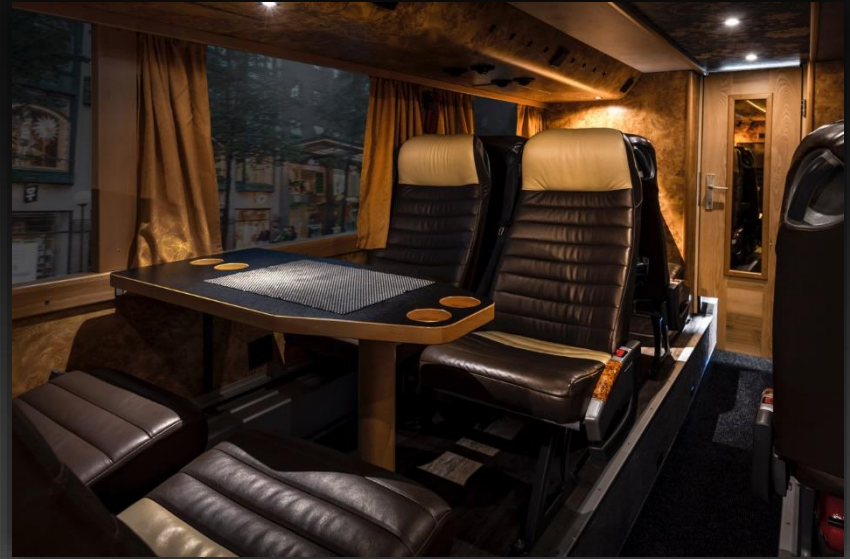
Lounge, lower deck