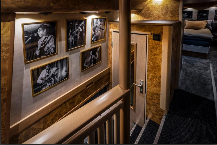
Stairs and WC