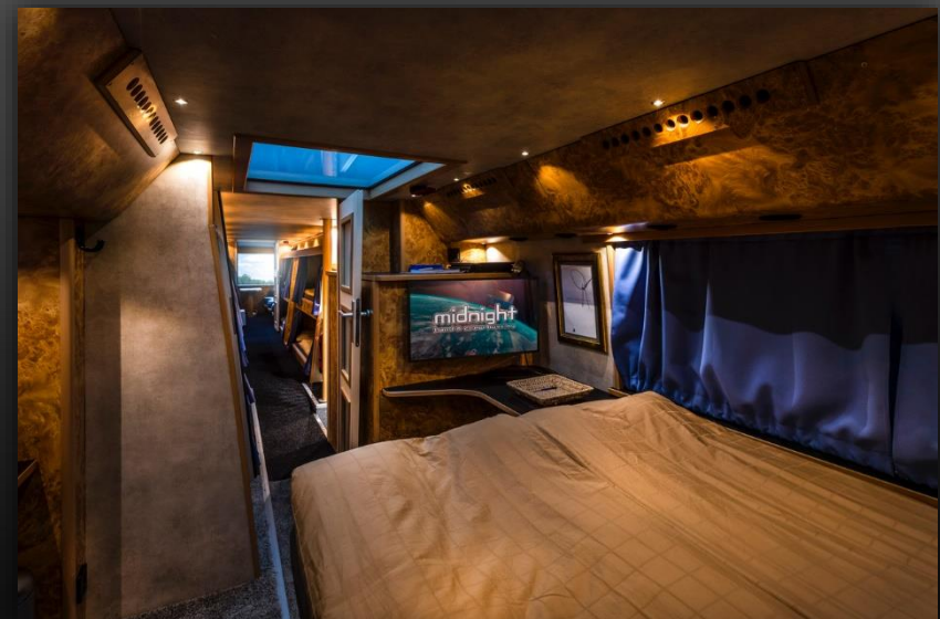
Star Suite, driving direction