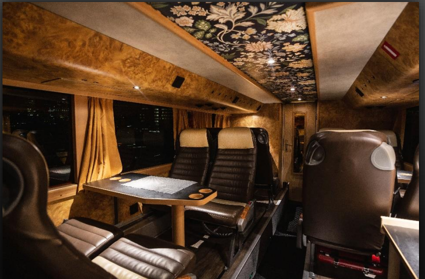
Lounge, lower deck