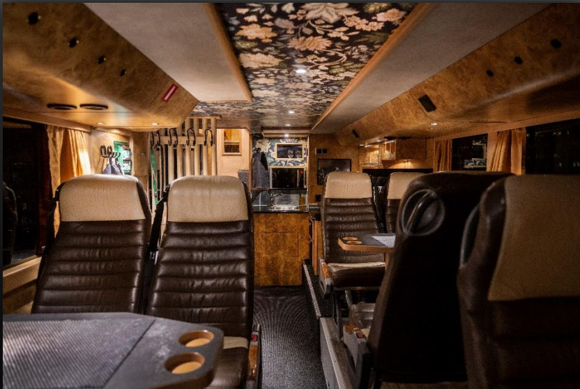
Lounge, lower deck