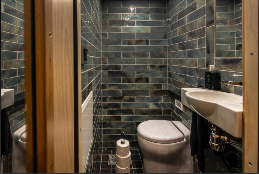
WC, with shower