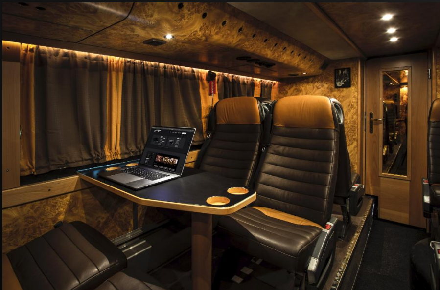
Lounge lower deck, driving direction