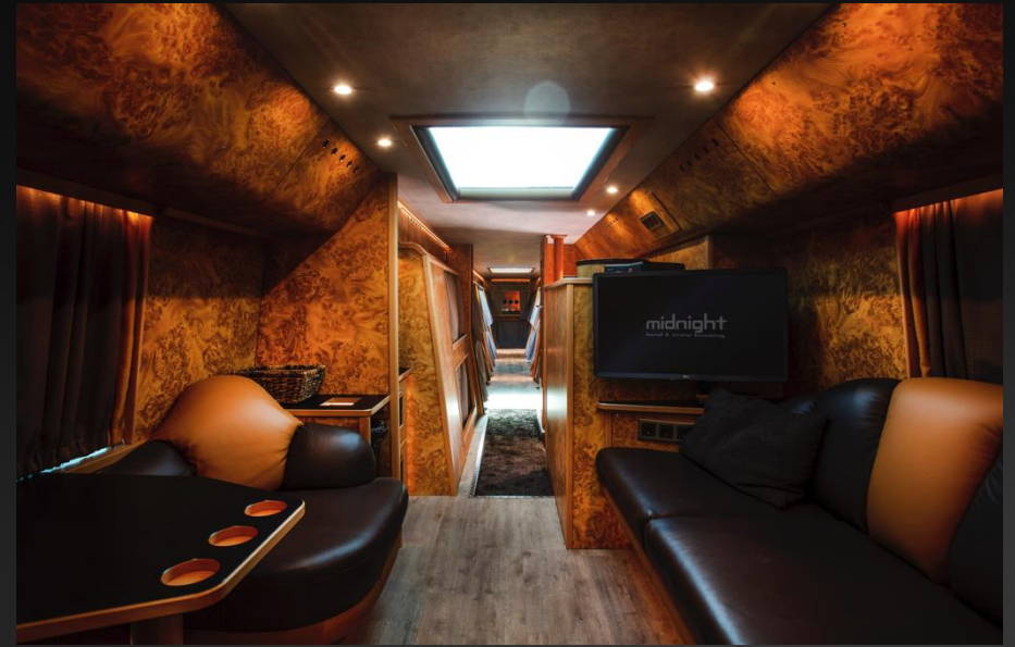
Rear lounge upper deck, driving direction