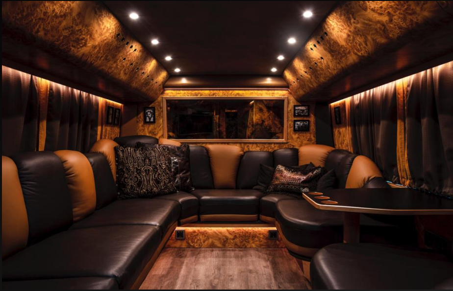
Rear lounge upper deck