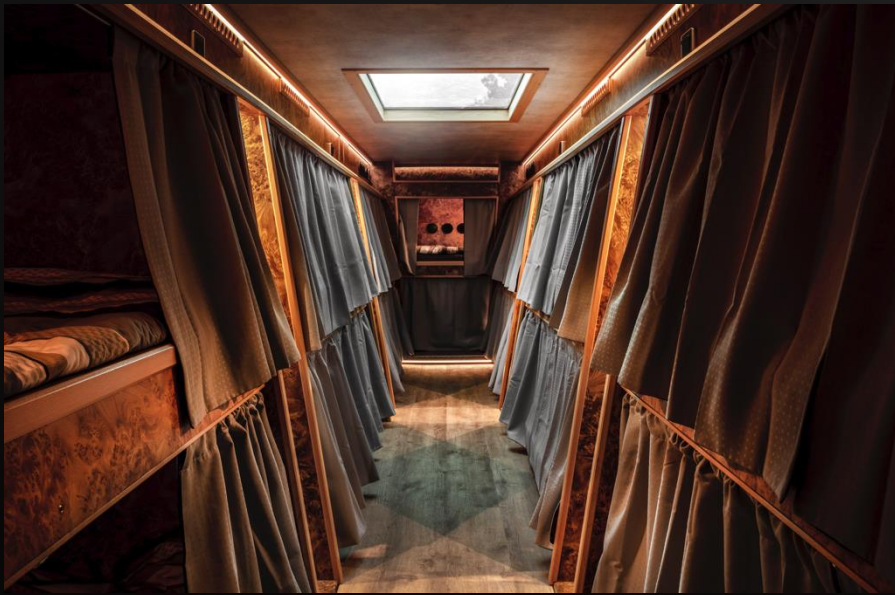
Bunk area, driving direction