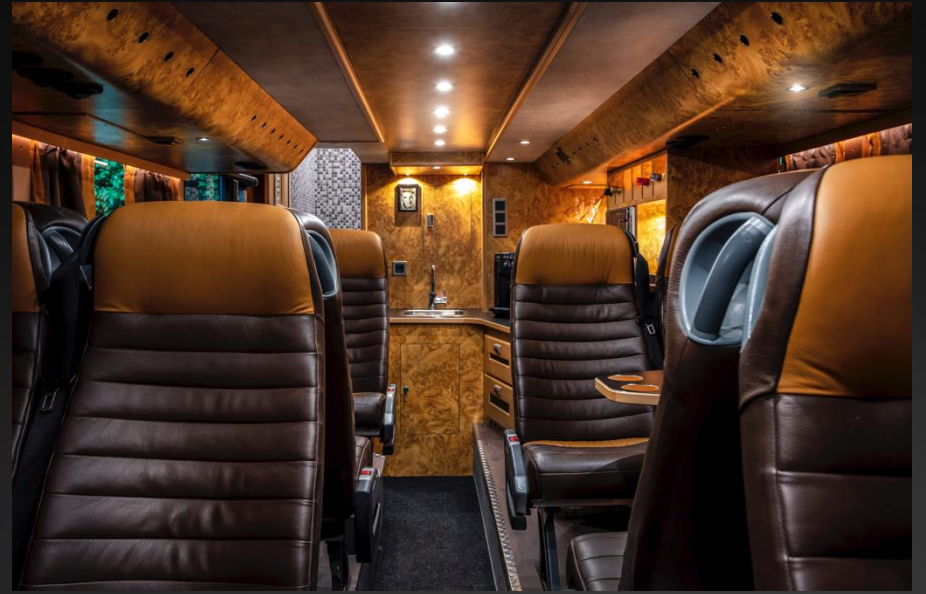
Lounge lower deck