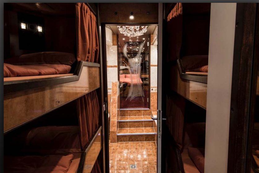
6 berths in passage