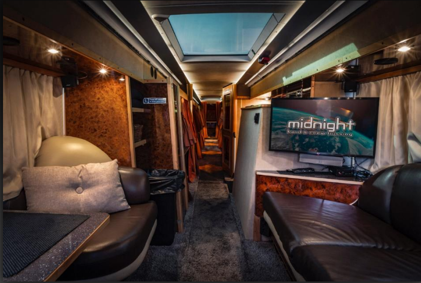
Rear lounge (driving direction)