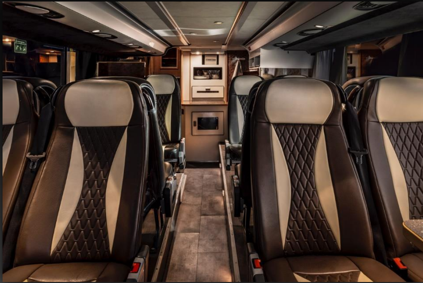
Lounge downstairs (all seats with belts)