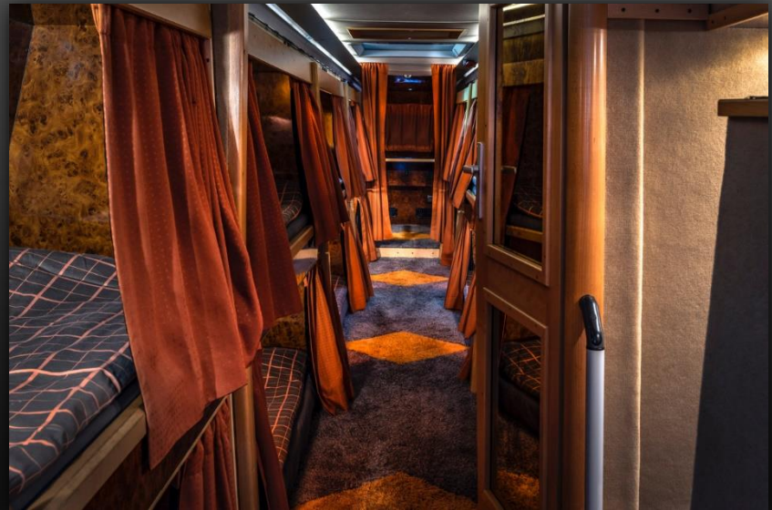
Bunk area (driving direction)