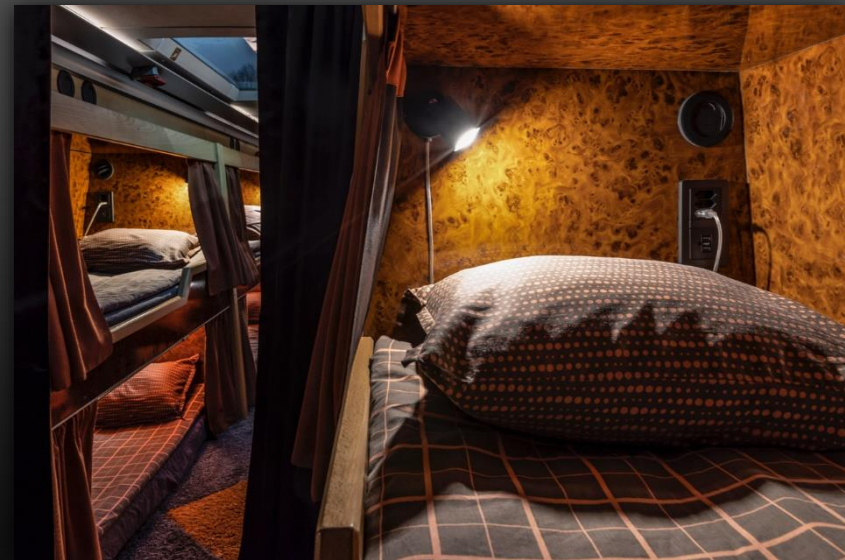
Bunk (230V power & USB charger)