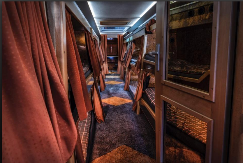
Bunk area (driving direction)