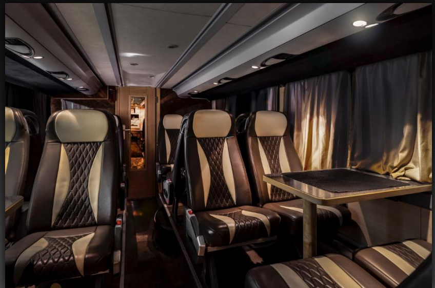
Lounge downstairs (driving direction)