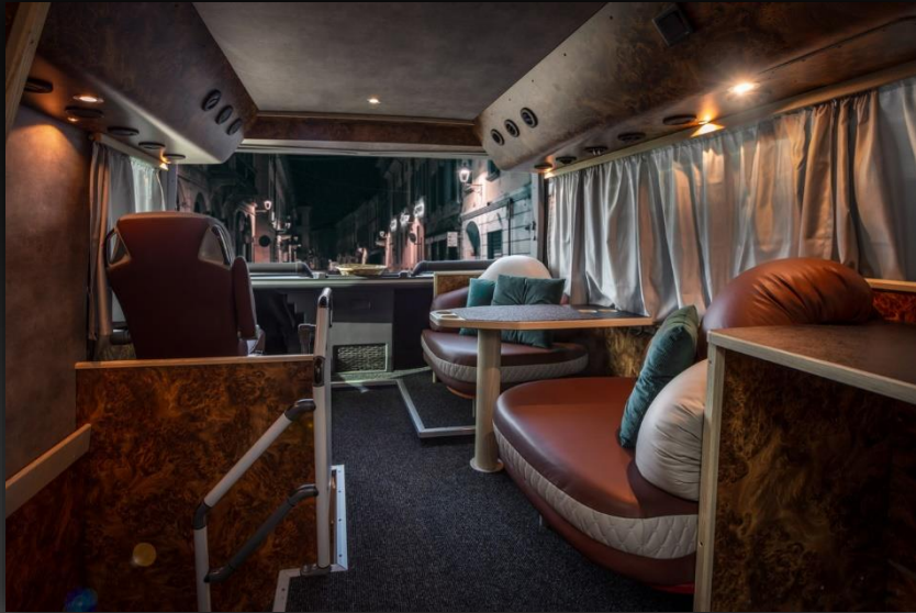
Front lounge upper deck (driving direction)