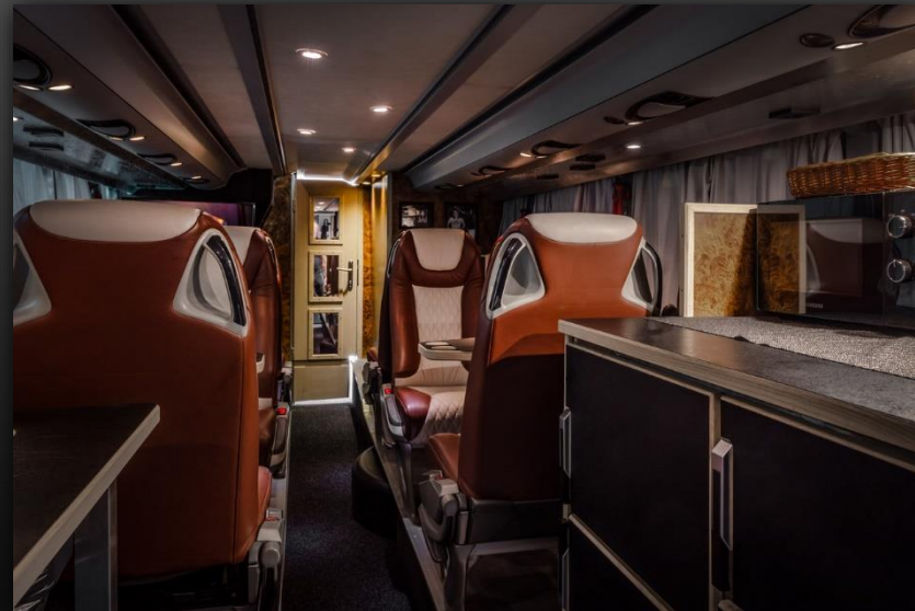
Lounge lower deck (driving direction)