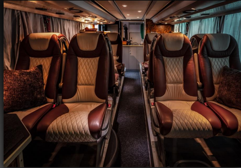
Lounge lower deck