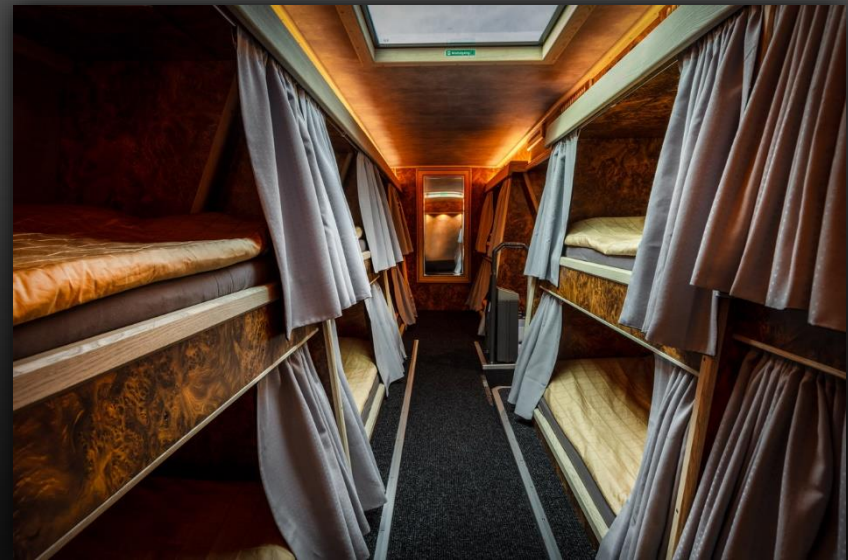
Sleeping area (driving direction)