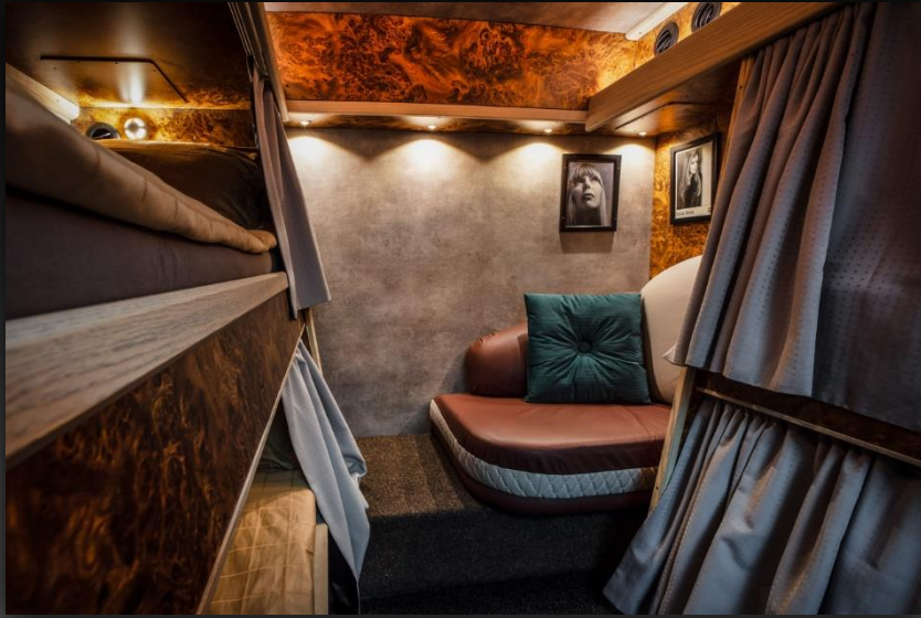
Read a book or hide out