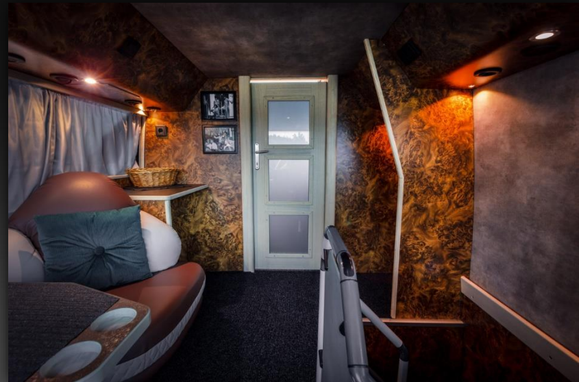
Front lounge upper deck