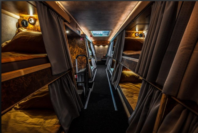
Sleeping area 14 bunks