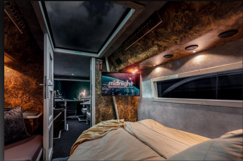
Suite (driving direction)