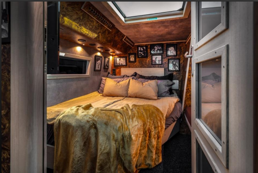
Suite with double bed