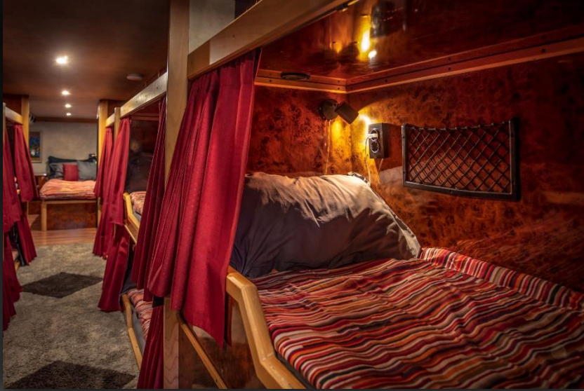
Open doors towards star room