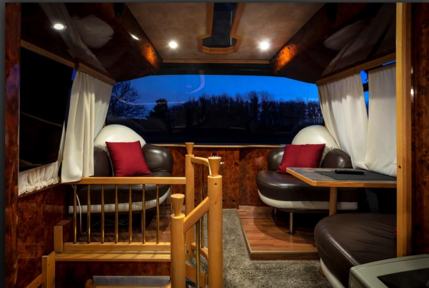
Upper front lounge