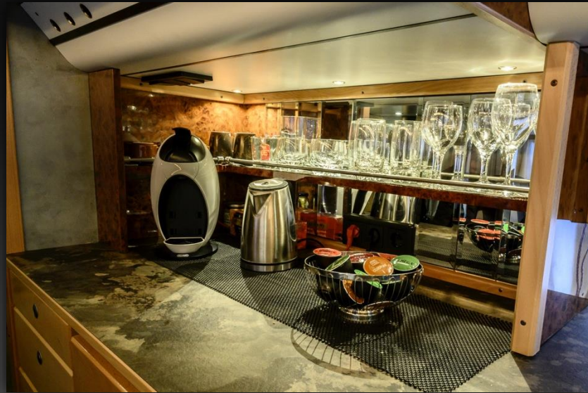
Coffe maker etc. of your choice