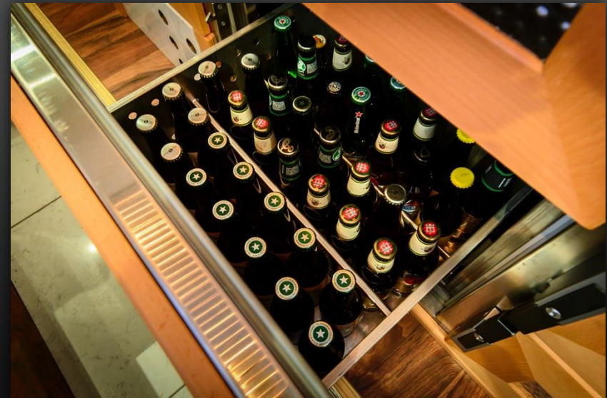
Large 5-drawer style fridge