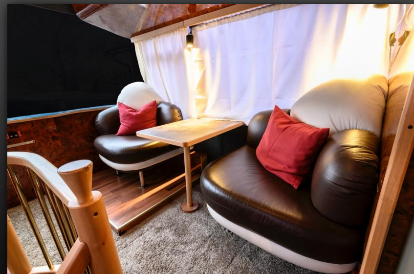
Upper front lounge