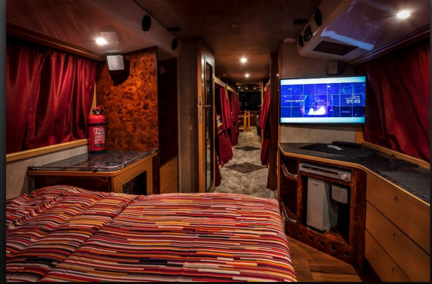
Star room (driving direction)