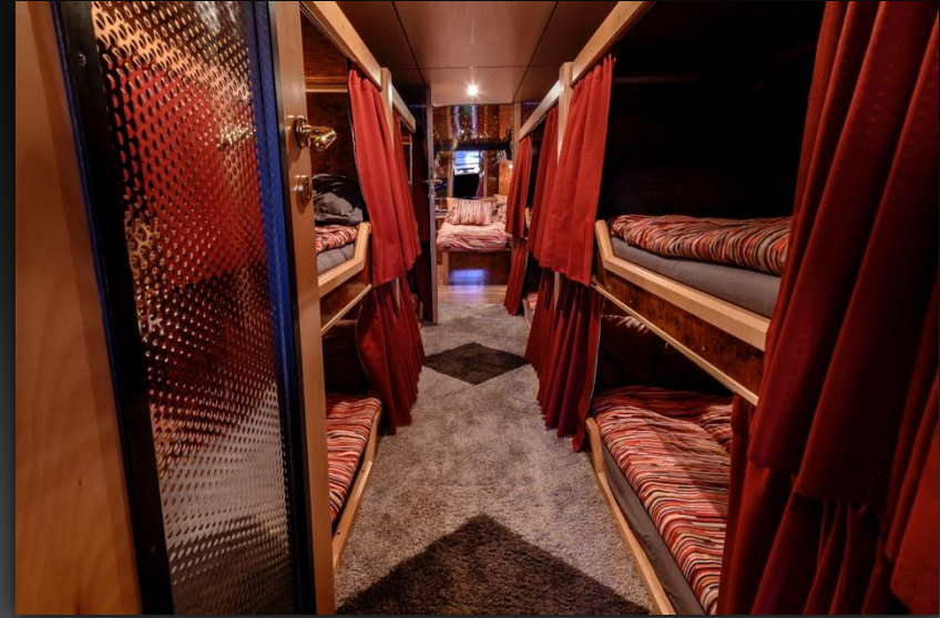
Second section of eight bunks