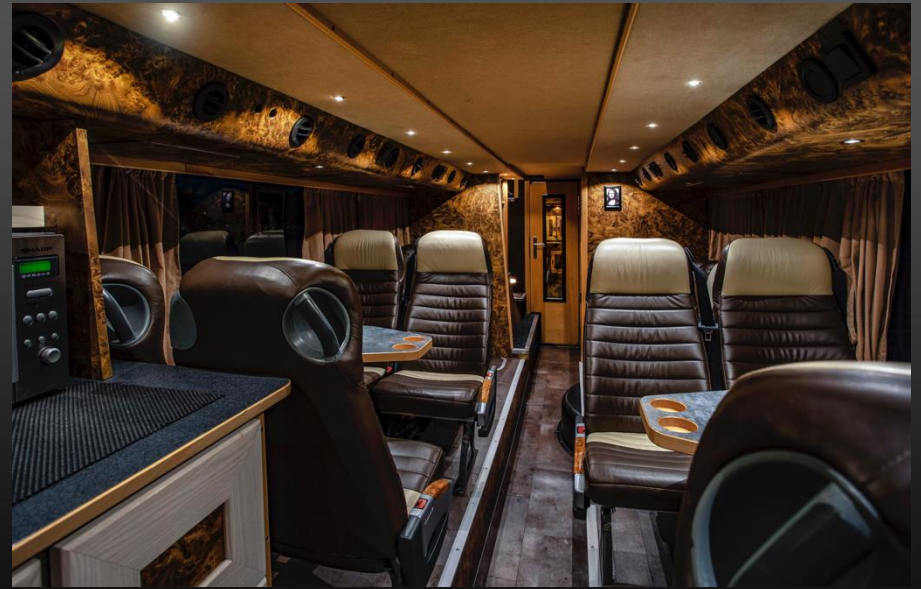
Lounge lower deck, driving direction