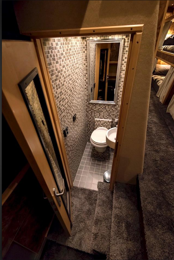
WC, located in stairs