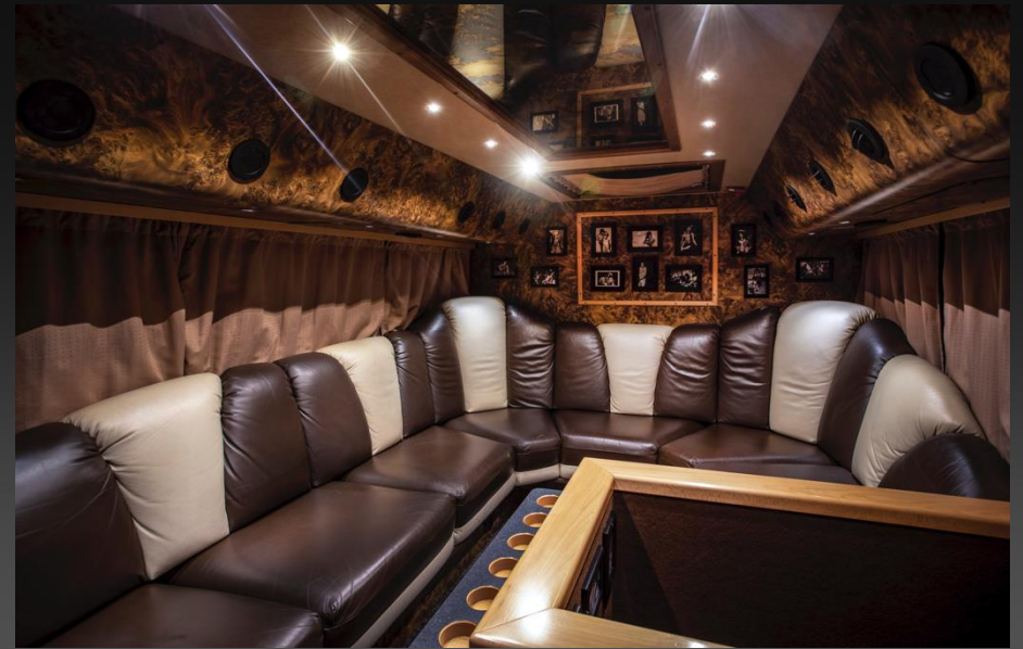
Front lounge upper deck