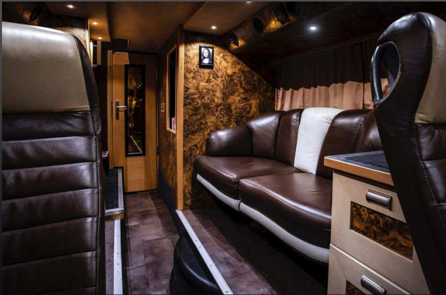
Lounge lower deck, driving direction