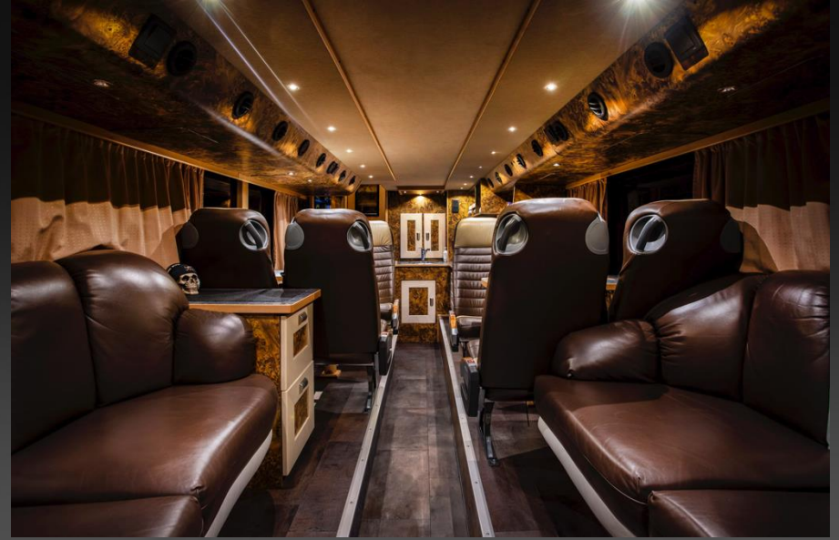
Sofa's lounge lower deck