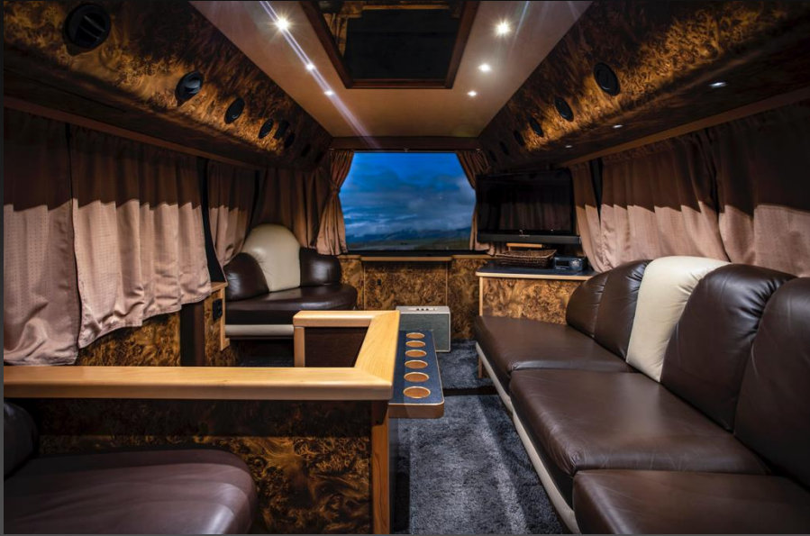
Front lounge upper deck, driving direction