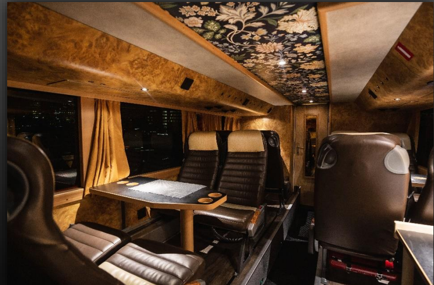
Lounge, lower deck