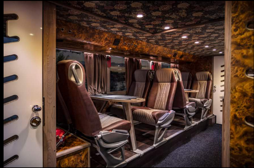
Seating lower deck.