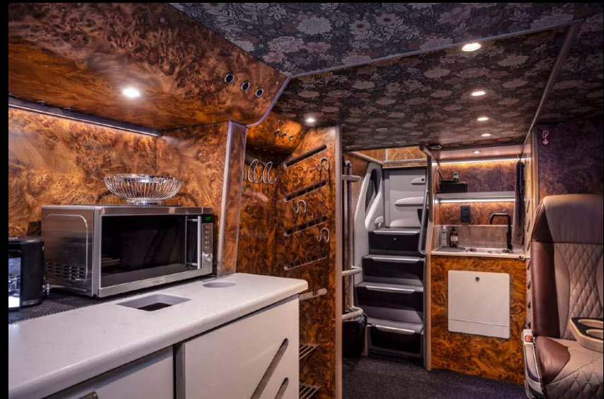
Entrance and stairs to upper deck.