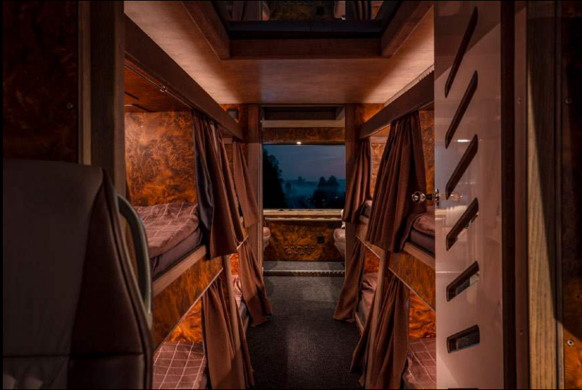
Upper deck towards front lounge.