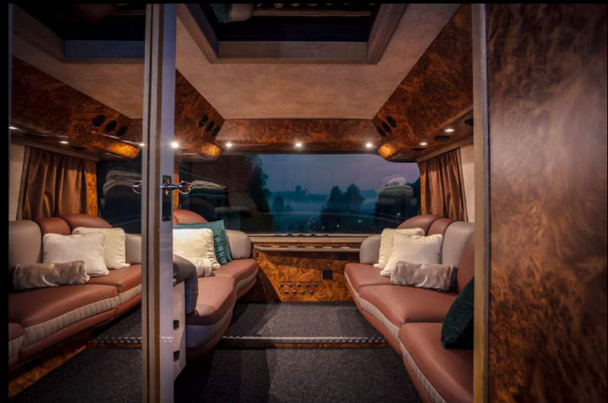
Front lounge driving direction.