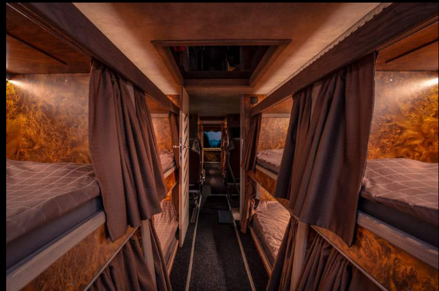
From rear to front.