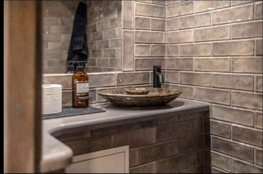
Soft quality design.