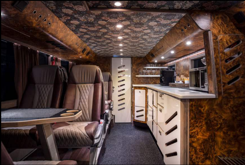
Lounge and kitchen area.