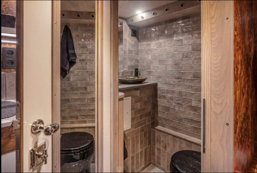
Fully tiled WC.