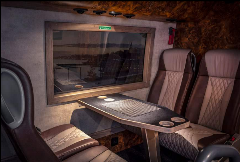
Upper mid lounge.