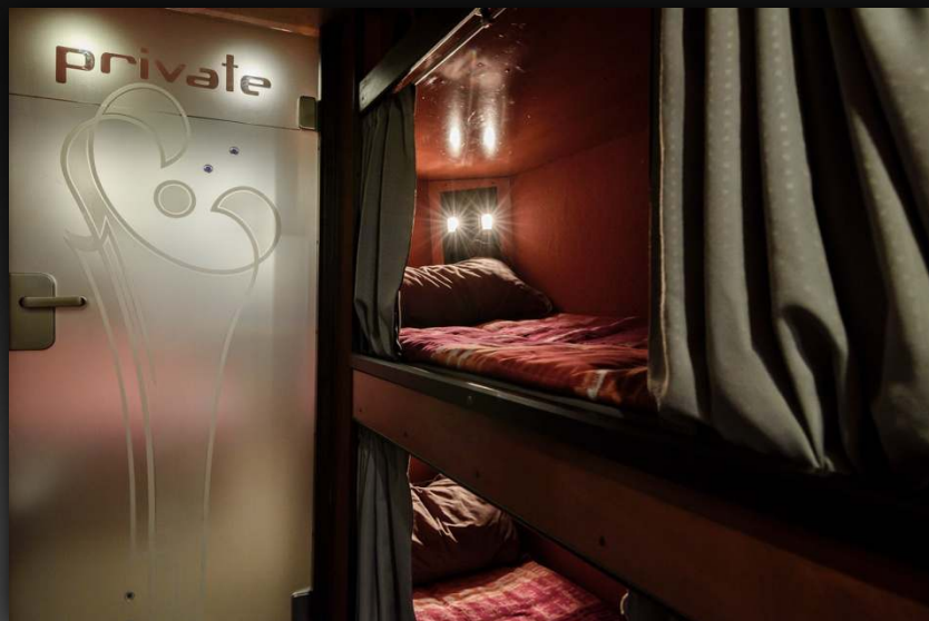
Two bunks x-large bunks