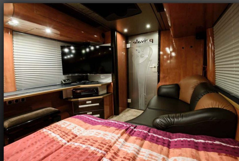
Executive suite driving direction